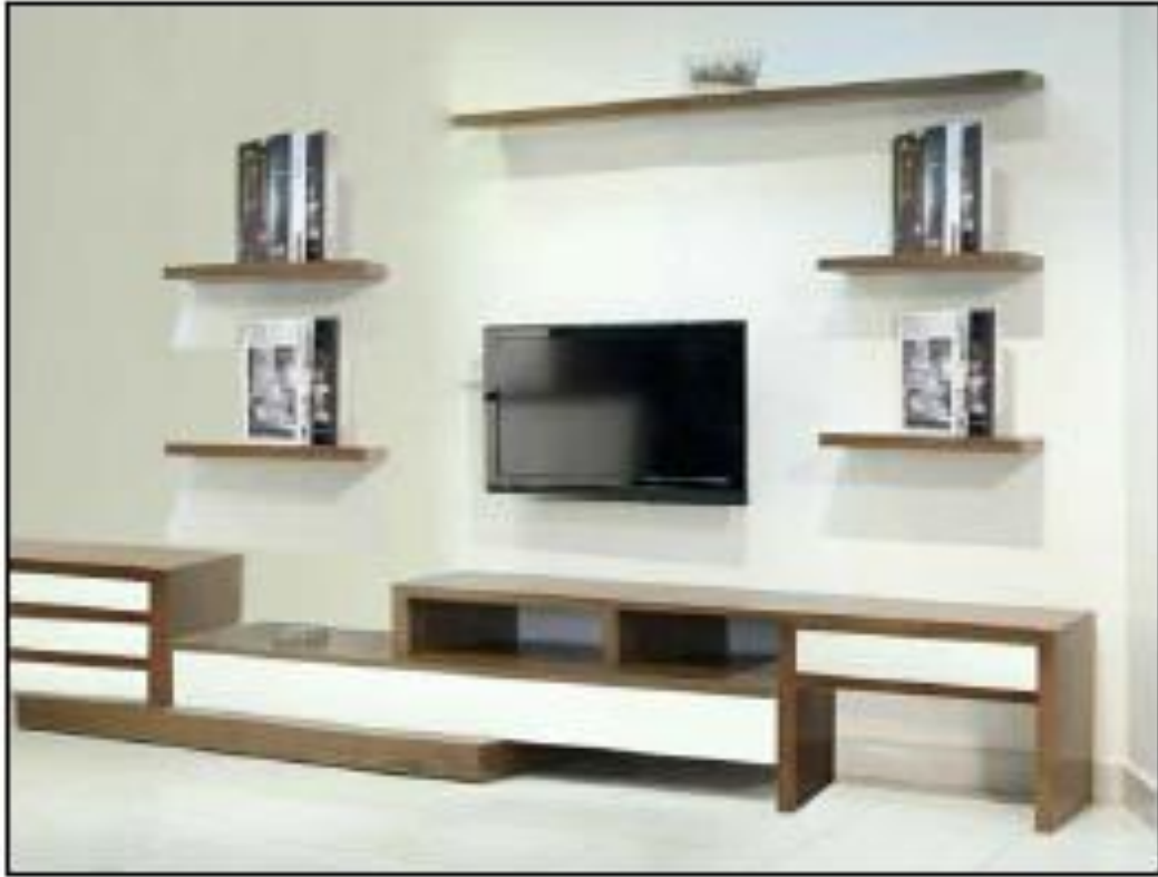
TV CONSOLE WITH WORKING TABLE